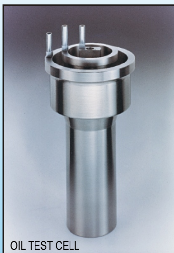
OIL TEST CELL