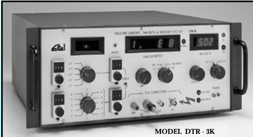
MODEL DTR - 3K