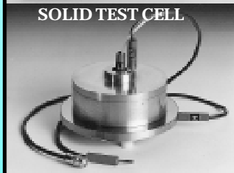
SOLID TEST CELL